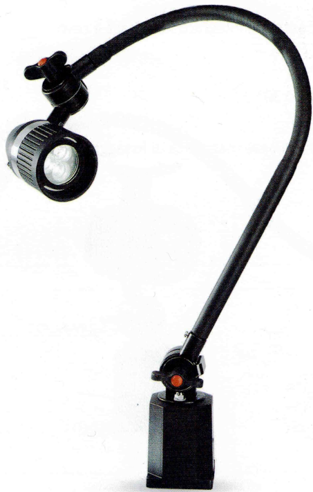
White LED lamps with swiveling body